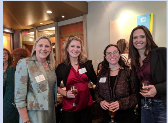
Women Owned Law Members and Volunteers Attending Events in Cities Across the Nation